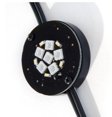
DFS4000 can be surface wired or wiring can be concealed behind the support surface.

* Super high employs current sharing so full white will NOT be the sum of all colours light output.