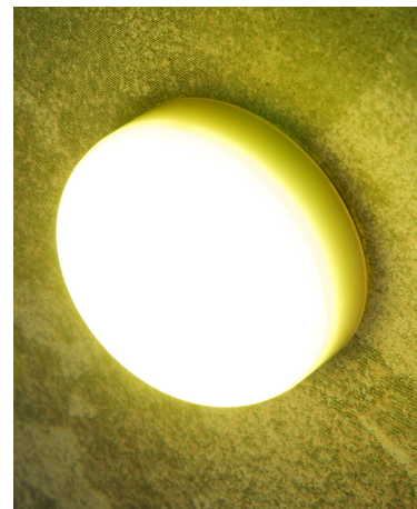
DFS4000 can be supplied with a clear, translucent or smoked cover.